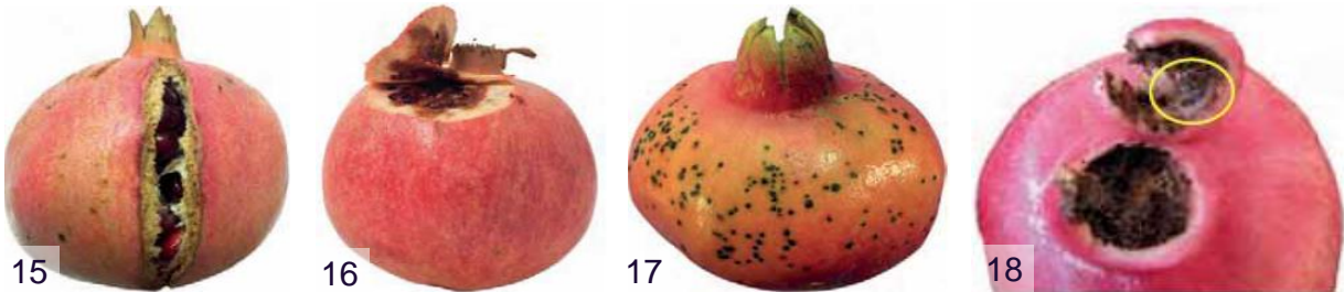
Photo 15: severe mechanical damages Photo 16: rotten Photo 17: agricultural diseases Photo 18: damaged by pests