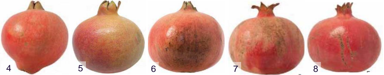
Photo 4: defect in shape Photo 5: defects in colour Photo 6: sunburn not exceeding 1/4 of the surface Photo 7: slight scuff marks Photo 8: slight scratches