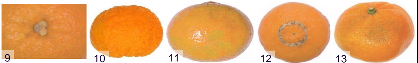
Photo 9: damaged fruit-stalk Photo 10: rough skin/ creasing Photo 11: contaminated, with chemical residues Photo 12: ring-cracking Photo 13: shrivelling and dehydration