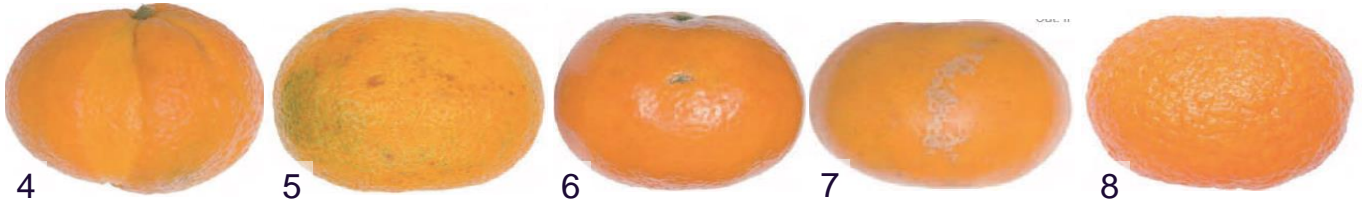
Photo 4: defect in shape Photo 5: sunburn Photo 6: healed defects due to a mechanical cause Photo 7: silver scurfs Photo 8: smooth skin