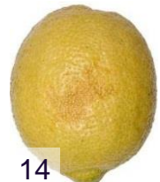
Photo 9: severe defects in shape Photo 10: severe skin defects Photo 11: dieback of styler end Photo 12: rough skin/creasing Photo 13,14: oil spotting