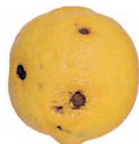
Photo 15: presence of dark green colour Photo 16: frozen Photo 17: damage caused by pests Photo 18,19: agricultural diseases