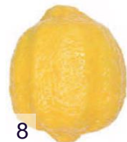
Photo 5: defect in shape Photo 6: healed skin defects Photo 7: silver and brown spots Photo 8: smooth skin