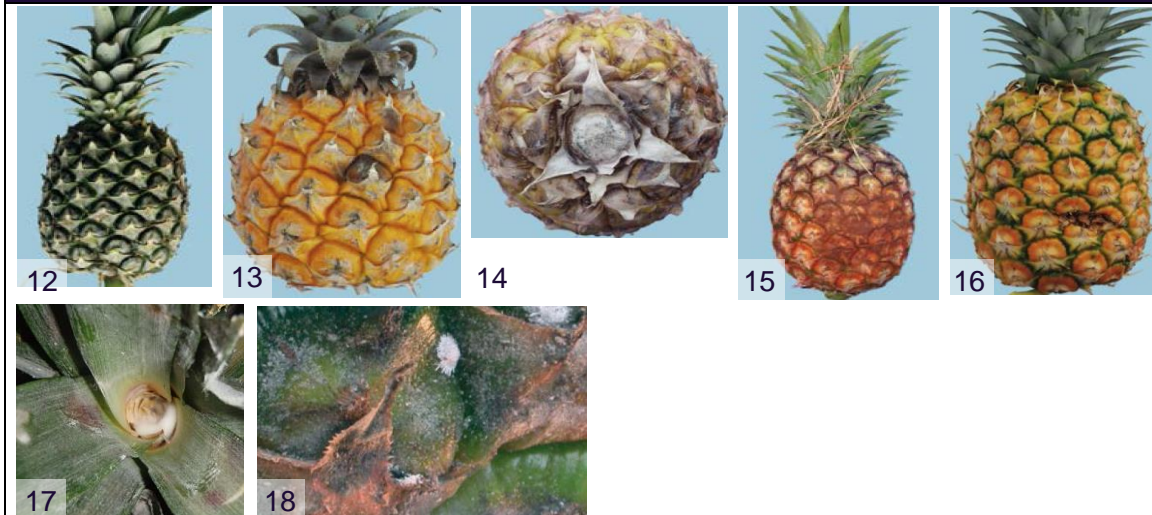
Photo 12: unripe Photo 13: rotten Photo 14: rotten on the cut of the crown Photo 15: damaged by pests Photo 16: non healed mechanical damage Photo 17: fallen out leaves of the crown Photo 18: presence of pests