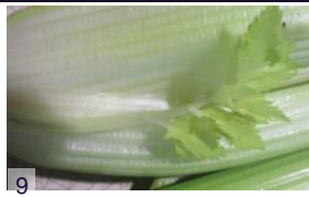
Photo 6: more than 2 cracked stalks Photo 7: contaminated of the cut Photo 8: signs of wilting Photo 9: side shoots